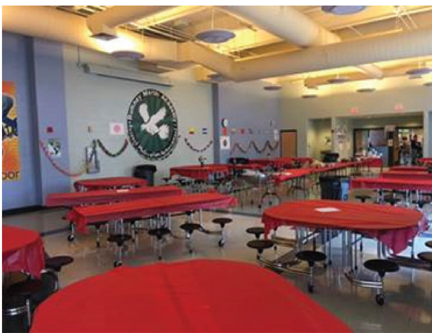
The set-up for Culture Night at Rumney Marsh Academy

“ Our team has taken up creating more tasks in an authentic way this year as a result of MCIEA, and it is impacting a lot of the planning teachers are doing around assessment. I can see a shift in myself and other teachers' thinking about assessment now as an engaging classroom opportunity. The relationships that were strengthened in my classroom because of this particular project were invaluable.”